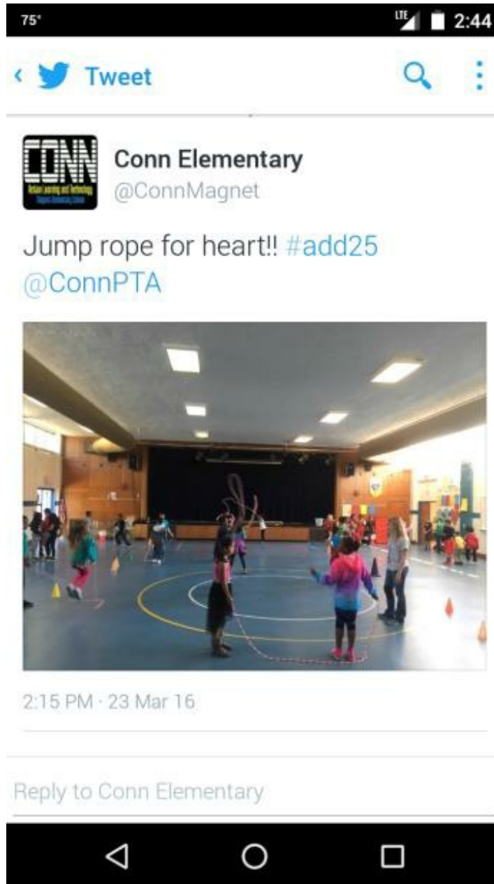
Conn Active Learning and Technology Magnet Elementary - Raleigh, NC