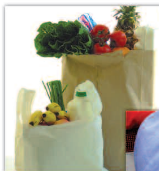
Eat Smart, Move More... North Carolina billboards