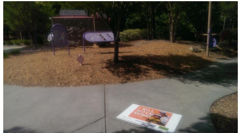
Visitors to the Poe Center's PlayWELL Park will see the "I Will Move More" message when they enter the park.

The Poe Center will be distributing floor graphics with the "I Will Move More" message in Bladen, Columbus, Halifax, Johnston, Sampson, Vance, East Wake, and Warren counties. Health Educators will place the graphics in public health departments and schools to promote physical activity.