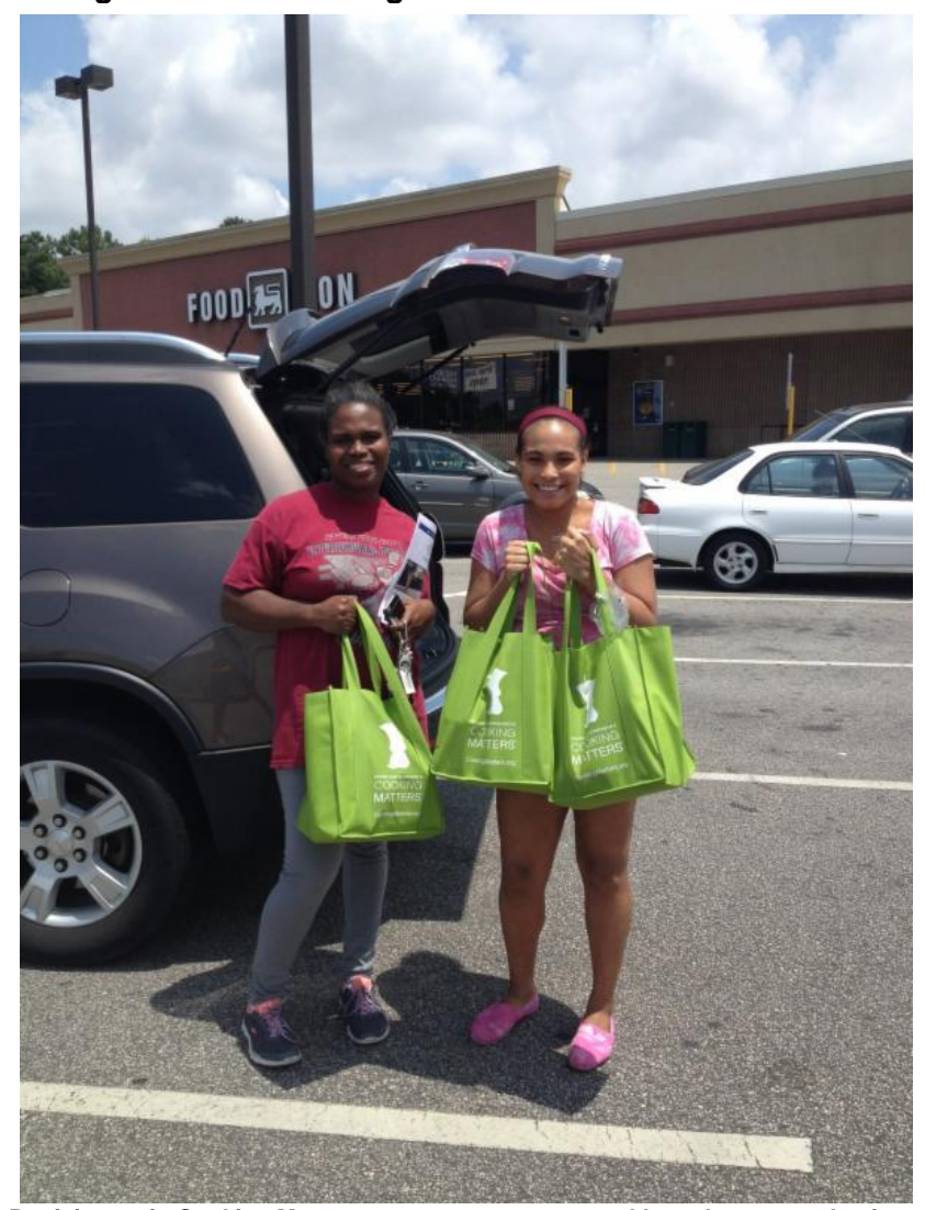
Participants in Cooking Matters tour a grocery store and learn how to read unit pricing and nutrition labels to help shop for healthy options when on a budget.

Through a partnership with the Inter-Faith Food Shuttle, the Poe Center is now offering Share Our Strength's "Cooking Matters Program." "Cooking Matters for Adults" engages adults in a series of participatory cooking classes designed to empower them to get the most nutrition out of limited budgets.