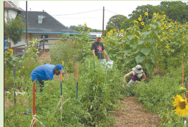
URBAN GARDENERS, CHARLOTTE.

There are many types of organizations that choose to sponsor and support community gardens. The following places may have land, resources, and interested employees or clients.