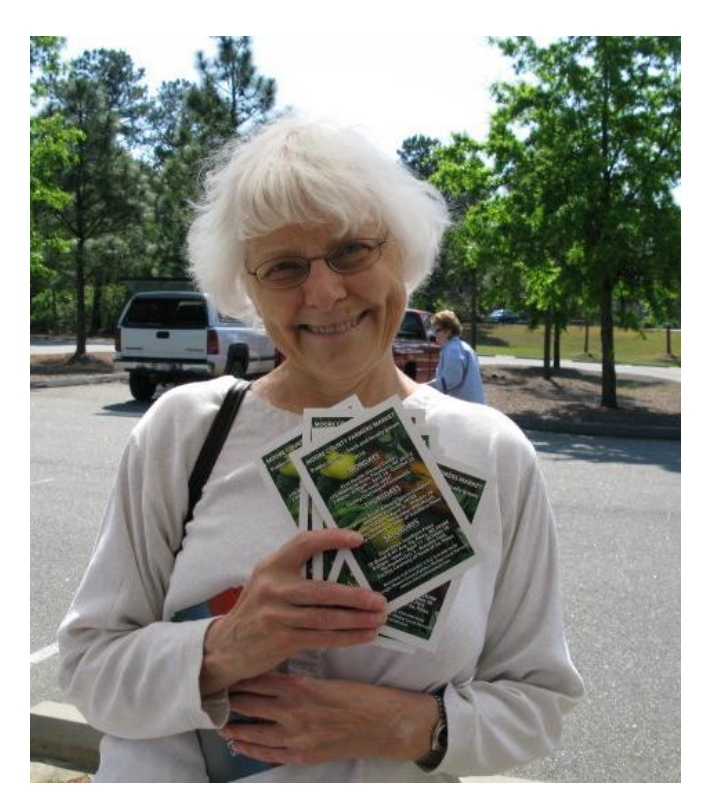
A Moore County Farmers' Market customer with outreach flyers explaining the SNAP/EBT match.

Contact information for this market is located in the Resources Section.