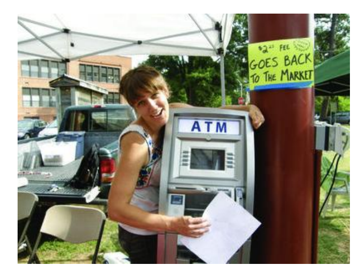
Carrboro Farmers' Market staff member with the market's ATM machine.

Contact information for this market is located in the Resources Section.