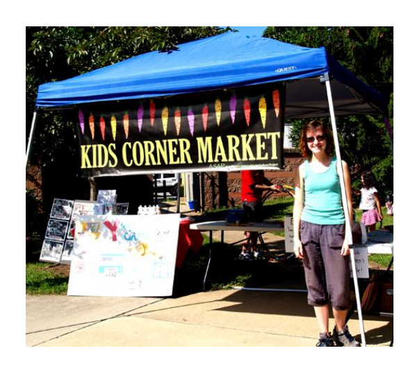
The Asheville City Market's Kids Corner Market

Contact information for this market is located in the Resources Section.